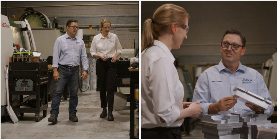
EOS' VP of Supply Chain visiting a local supplier site.

With the growth of our global footprint, EOS has expanded into offshore manufacturing to scale its production. We maintain a critical and highly valued network of international suppliers, particularly within the countries we operate in.