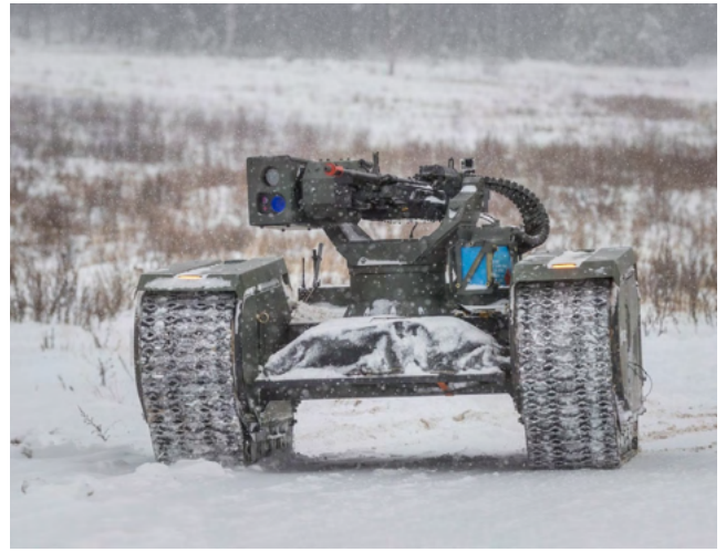
The R600 and the Milrem THeMIS.

Like its lighter family members, the R600 is 'plug-and-play' compatible and is easily integrated with battle management systems.