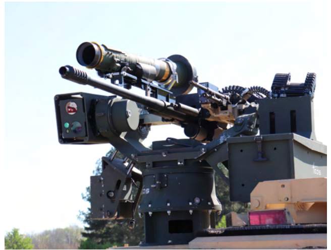
The R600 with Javelin missile, 30 x 113 mm cannon and 7.62 mm machine gun.