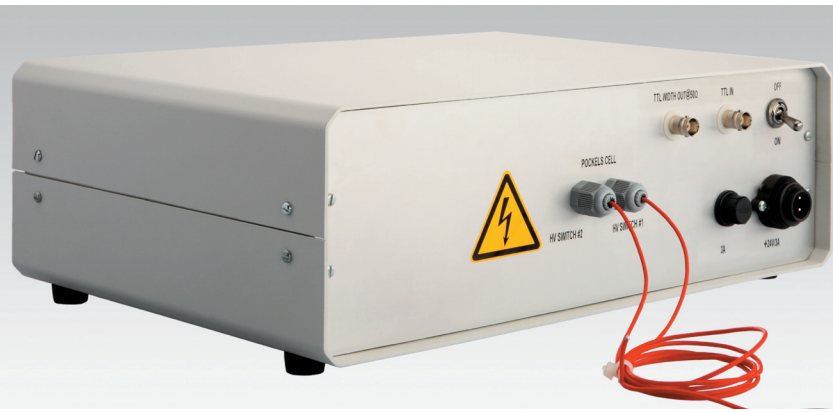
PCD-10kV Pockels Cell Driver – 10kV